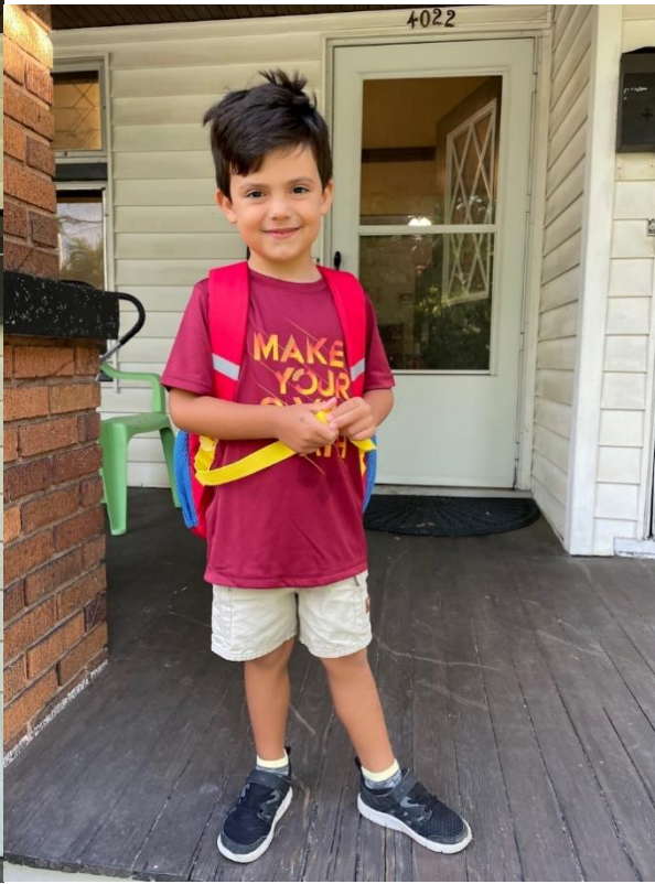
1st Family Picture in Cleveland