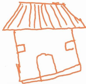
This is my dream house in future.