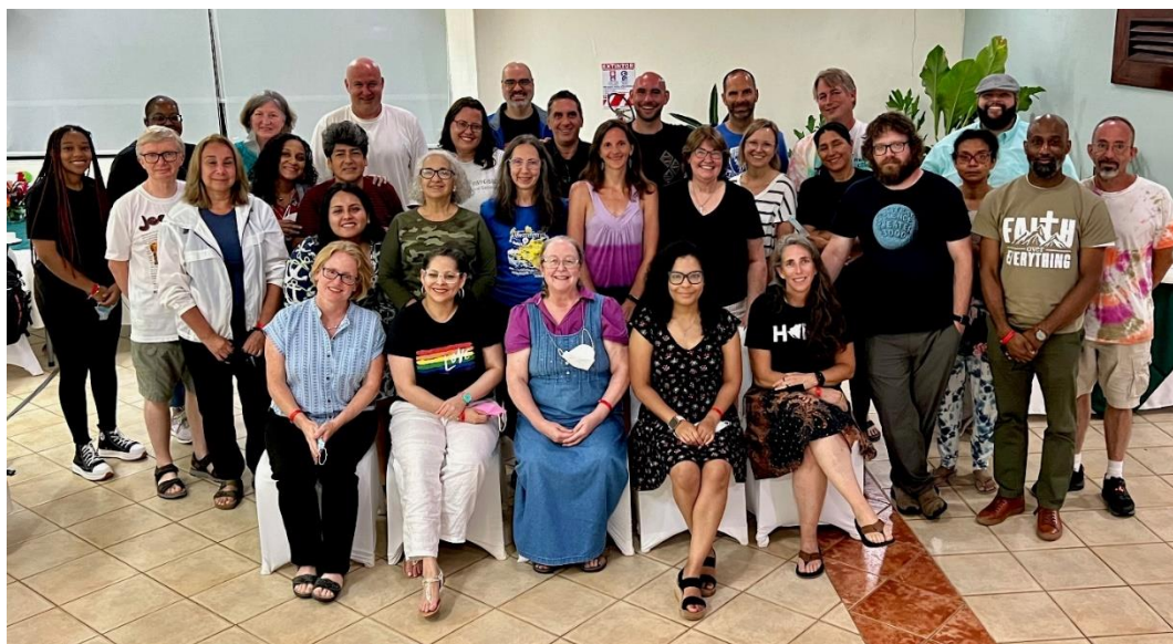
Mission Co-Workers of Latin America and the Caribbean at the Regional Gathering in Costa Rica