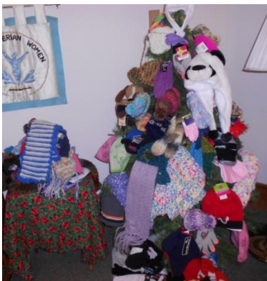
Our "Stocking Tree" continued to grow with items of warmth each week.