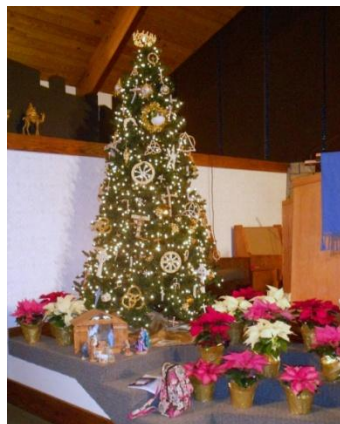
Some of the Chrismons on our tree were made by the women of Forest Avenue Church 50 years ago.