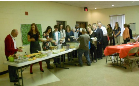
A potluck followed the Sunday School Christmas Program.